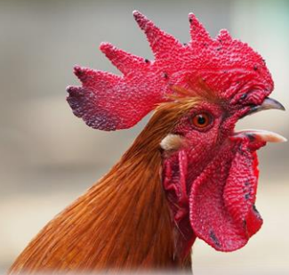
Animal Health & Welfare

More than 20 lectures in three main panels