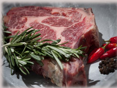
Animal Production & Food Safety